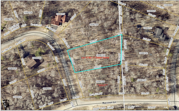
These data are provided on an "AS-IS" basis, without warranty of any type expressed or implied, including but not limited to any warranty as to their performance, merchantability, or fitness for any particular purpose. Lot 10 Blk 17 Green Scene Date: 7/10/2023 Time: 10:48 AM