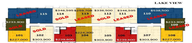
UNIT 106 ADA ACCESSIBLE LEVEL 1 PLAN