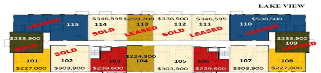
LEVEL 1 PLAN