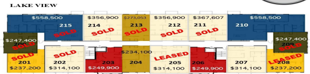
LEVEL 2 PLAN