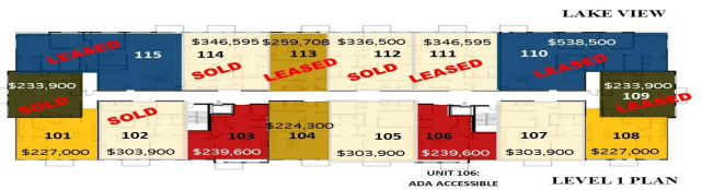
LEVEL 1 PLAN

Lake N Woods Realty, Inc. 1032 Paul Bunyan Drive South (218) 751-2538 www.lakenwoods.com