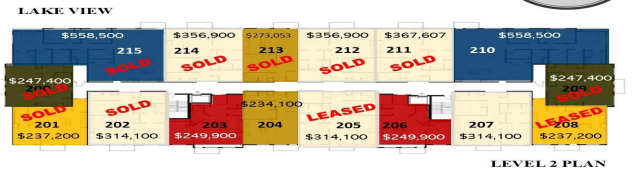
LEVEL 2 PLAN