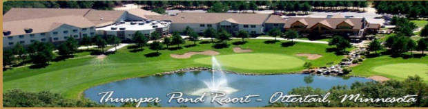
Thumper Pond Resort - Ottertail, Minnesota

Start planning your Thumper Pond getaway today!