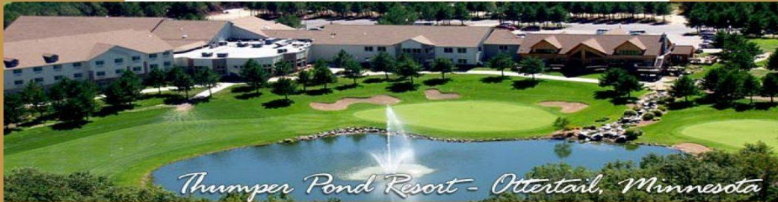
Thumper Pond Resort - Ottertail, Minnesota

Start planning your Thumper Pond getaway today!