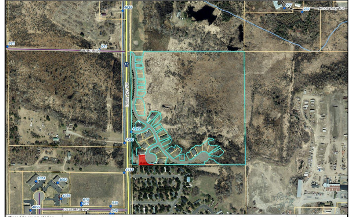
4240 Irvine Ave NW Unit 31 Beltrami County Minnesota 1:6,329 Date: 9/16/2022 These data are provided on an "AS-IS" basis, without warranty of any type, expressed or implied, including but not limited to any warranty as to their performance, merchantability, or fitness for any particular purpose. This map is not a substitute for accurate field surveys or for locating actual property lines and any adjacent features.