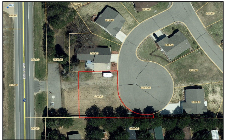
4240 Irvine Ave NW Unit 31 Beltrami County Minnesota 1:791 Date: 9/16/2022 These data are provided on an "AS-IS" basis, without warranty of any type, expressed or implied, including but not limited to any warranty as to their performance, merchantability, or fitness for any particular purpose. This map is not a substitute for accurate field surveys or for locating actual property lines and any adjacent features.