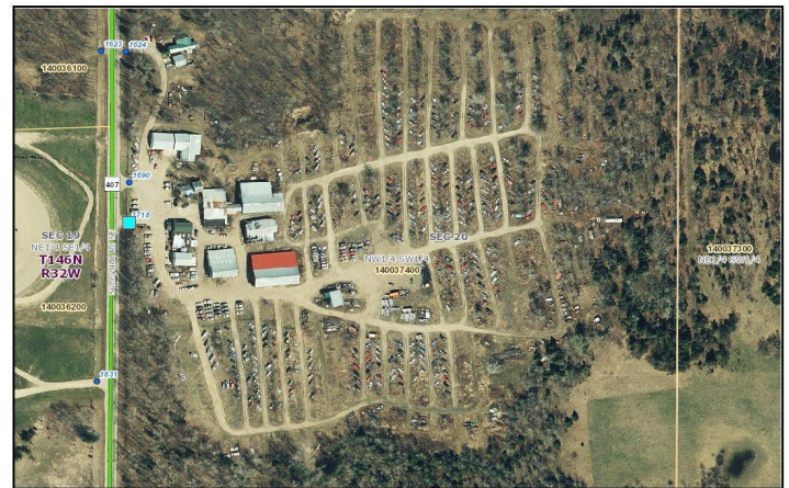
AAZZEES OVERHEAD closeup Jay Dauner 13.006 Date: 9/29/2023 This map is not a substitute for accurate field surveys or for locating actual property lines and any adjacent features.