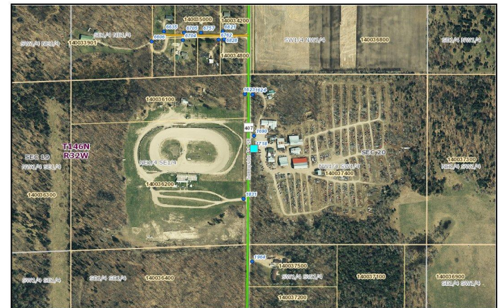
These data are provided on an "AS-IS" basis, without warranty of any type, expressed or implied, including but not limited to any warranty as to their performance, merchantability, or fitness for any particular purpose. AAZZEES OVERHEAD Jay Dauner 16.012 Date: 9/29/2023 Beltrami County Minnesota