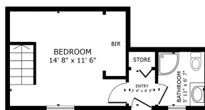
FLOOR 1 GROSS INTERNAL AREA FLOOR 1 234 sq. ft., FLOOR 2 899 sq. ft. TOTAL: 1,133 sq. ft. SIZES AND DIMENSIONS ARE APPROXIMATE. ACTUAL MAY VARY.