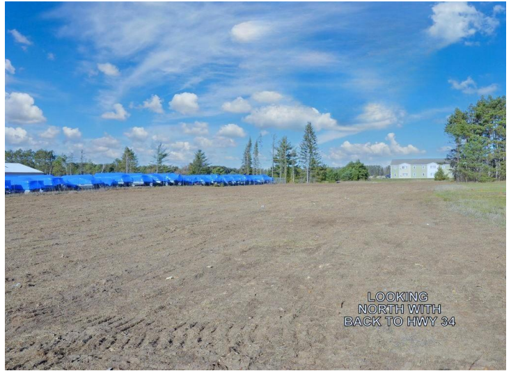
LOOKING NORTH WITH BACK TO HWY 34