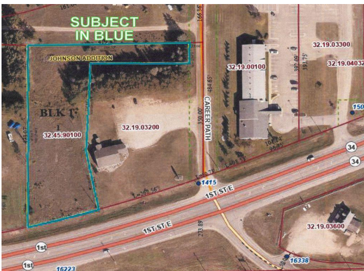
SUBJECT IN BLUE

website: www.AffinityRealEstate.com | email: info@affinityrealestate.com | office: 218-237-3333 | fax: 218-237-3377