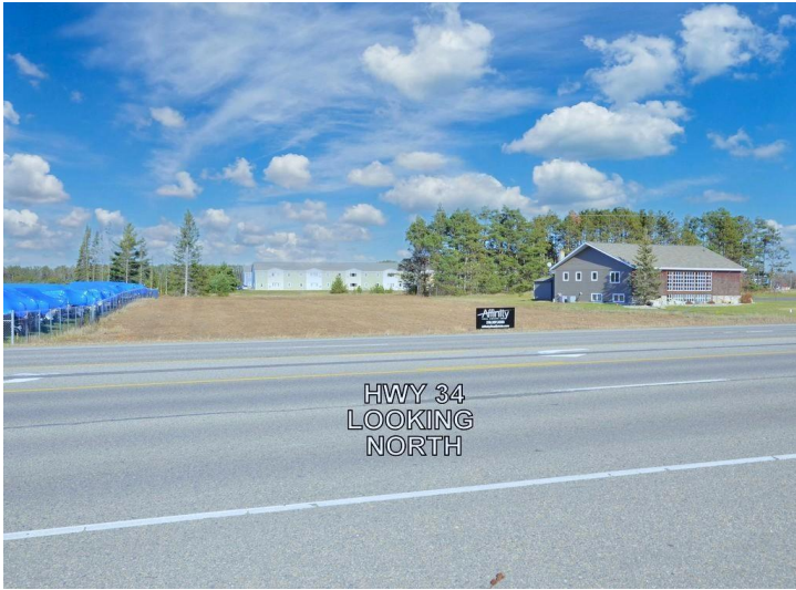
HWY 34 LOOKING NORTH