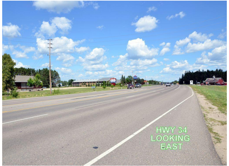
HWY 34 LOOKING EAST