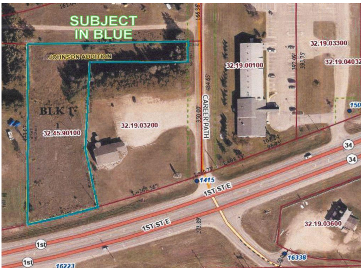
SUBJECT IN BLUE

website: www.AffinityRealEstate.com | email: info@affinityrealestate.com | office: 218-237-3333 | fax: 218-237-3377