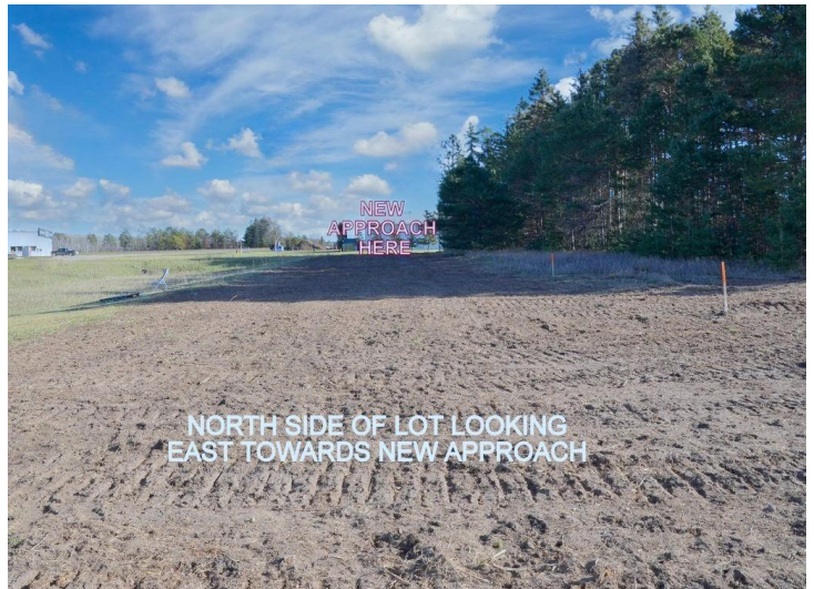
NEW APPROACH HERE NORTH SIDE OF LOT LOOKING EAST TOWARDS NEW APPROACH

website: www.AffinityRealEstate.com | email: info@affinityrealestate.com | office: 218-237-3333 | fax: 218-237-3377