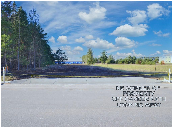
NE CORNER OF PROPERTY OFF CAREER PATH LOOKING WEST