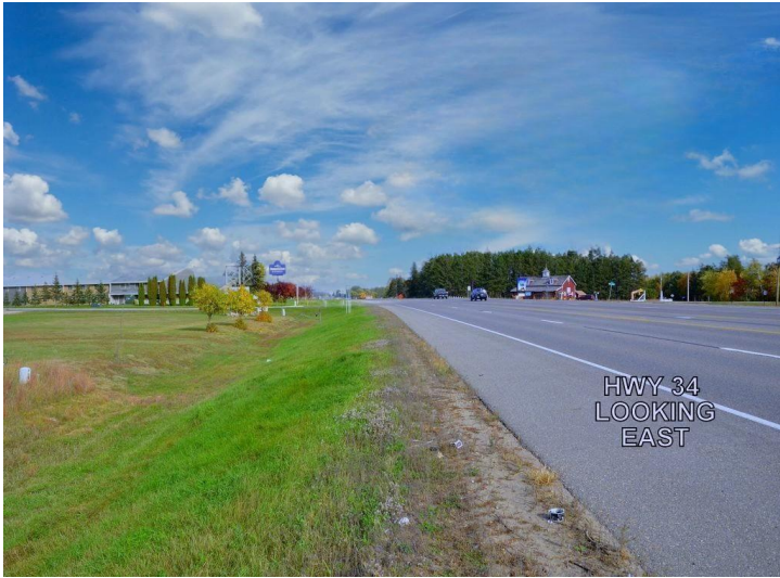
HWY 34 LOOKING EAST