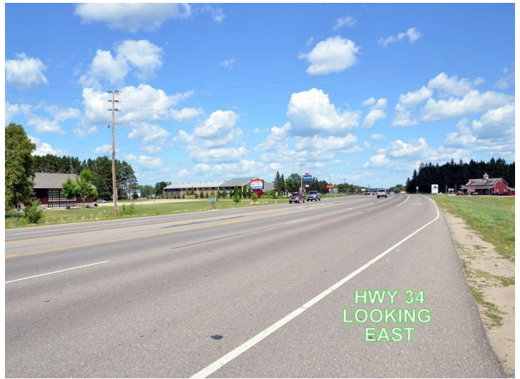
HWY 34 LOOKING EAST