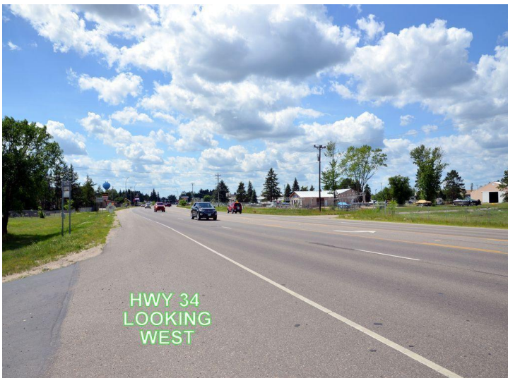
HWY 34 LOOKING WEST