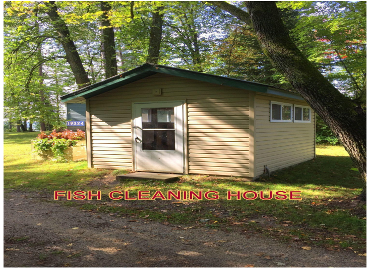
FISH CLEANING HOUSE