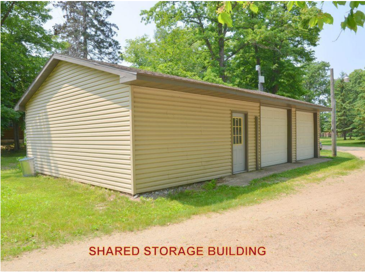
SHARED STORAGE BUILDING