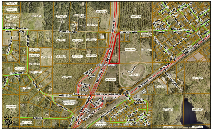
These data are provided on an "AS-IS" basis, without warranty of any type, expressed or implied, including but not limited to any warranty as to their performance, merchantability, or fitness for any particular purpose. Date: 3/14/2024 Time: 1:49 PM

website: www.AffinityRealEstate.com | email: info@affinityrealestate.com | office: 218-237-3333 | fax:218-237-3377