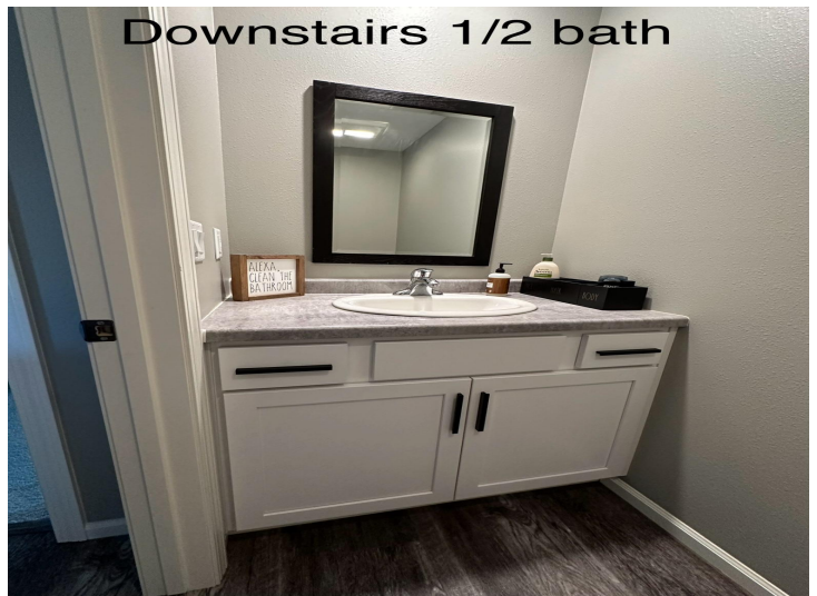
Downstairs 1/2 bath