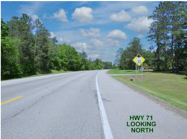
HWY 71 LOOKING NORTH