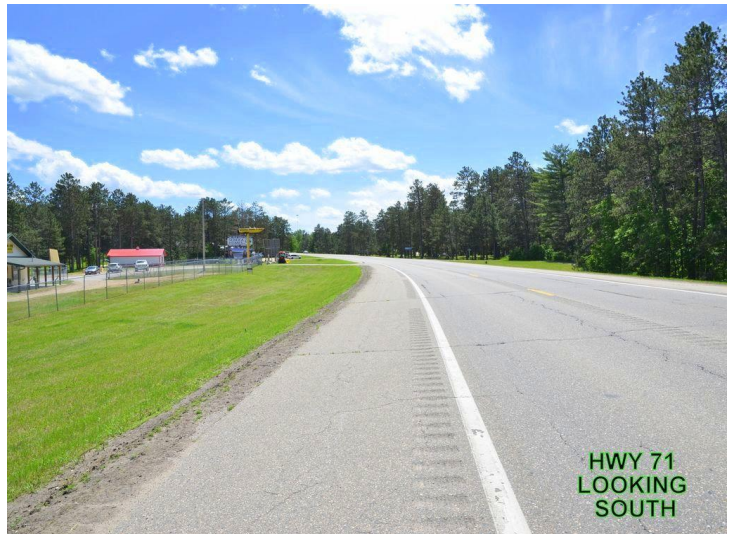
HWY 71 LOOKING SOUTH