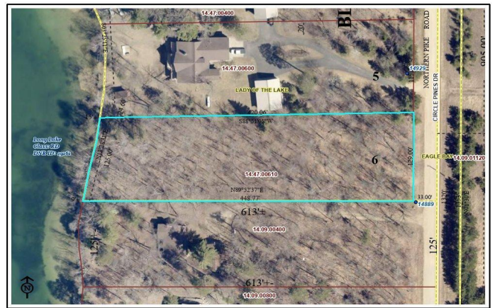
Parcel Viewer Hubbard County - 301 Court Ave, Park Rapids, MN 56470 Created 5/22/2024 at 08:31 AM

website: www.AffinityRealEstate.com | email: info@affinityrealestate.com | office: 218-237-3333 | fax: 218-237-3377