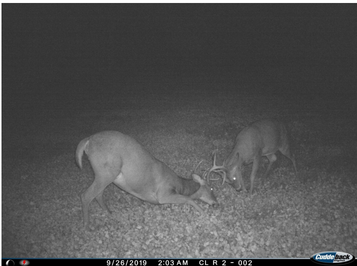
9/26/2019 2:03 AM CL R 2 - 002