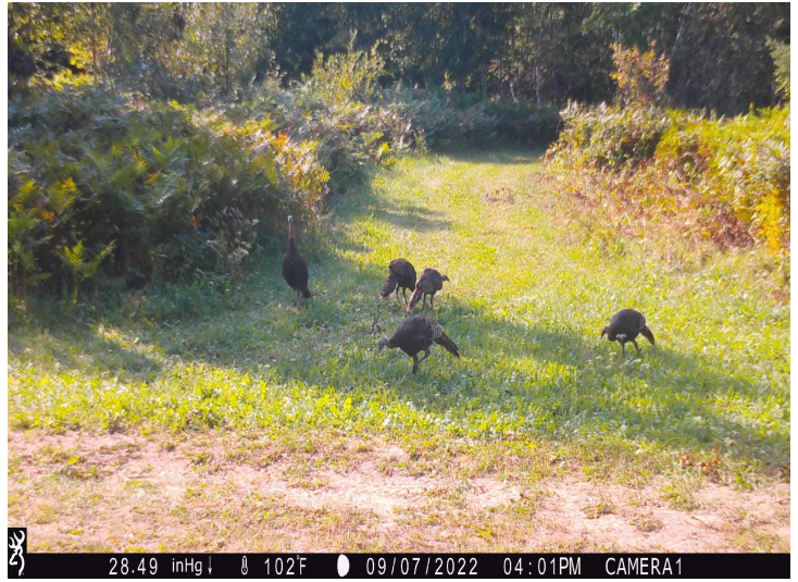
28.49 inHg ↓ 102°F 09/07/2022 04:01PM CAMERA1