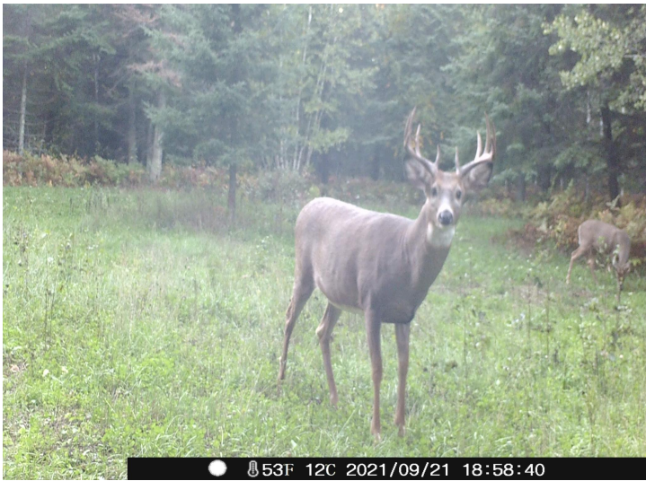
53°F 12C 2021/09/21 18:58:40