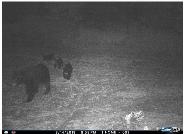
8/14/2019 8:58 PM 1 HOME - 001

website: www.AffinityRealEstate.com | email: info@affinityrealestate.com | office: 218-237-3333 | fax:218-237-3377