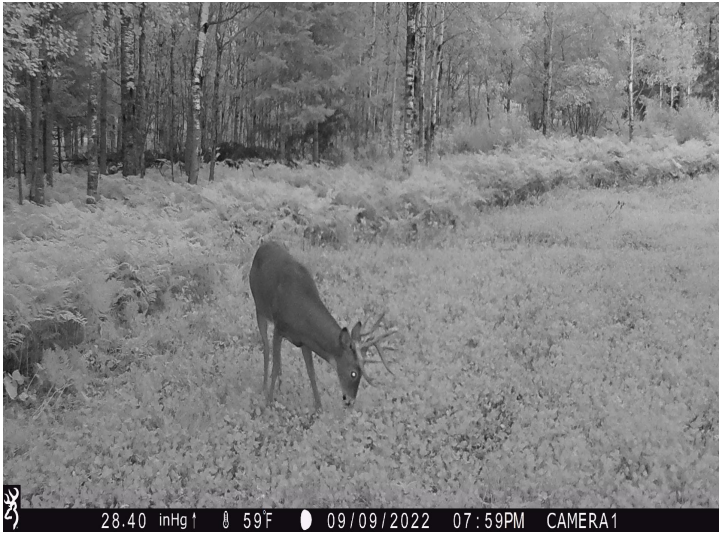
28.40 inHg ↑ 59°F 09/09/2022 07:59PM CAMERA1