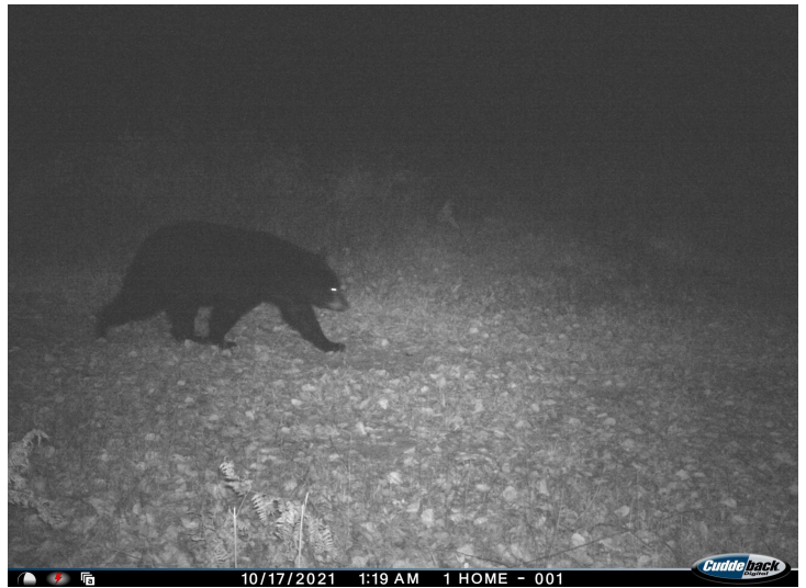
10/17/2021 1:19 AM 1 HOME - 001