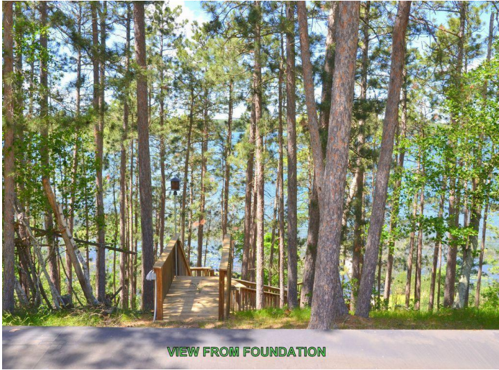
VIEW FROM FOUNDATION