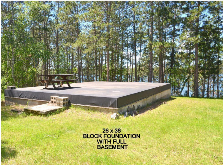
26 x 36 BLOCK FOUNDATION WITH FULL BASEMENT