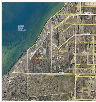
30945 Vahalla Lane

Hubbard County 301 Court Ave, Park Rapids, MN 56640 Created 7/17/2024 at 03:27 PM