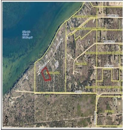
30945 Vahalla Lane Hubbard County - 301 Court Ave, Park Rapids, MN 56470 Created: 7/3/2024 at 03:27 PM