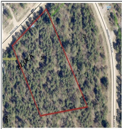
30945 Vahalla Lane map 2 Hubbard County - 301 Court Ave, Park Rapids, MN 56470 Created: 7/3/2024 at 03:27 PM