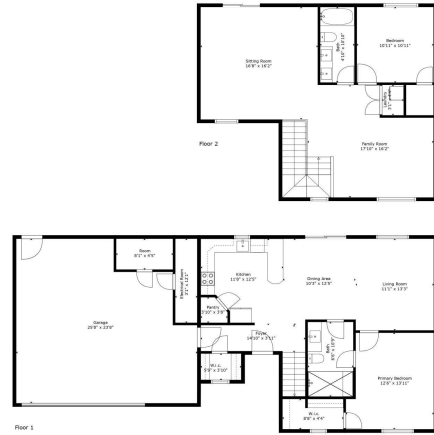
TOTAL: 1584 sq. ft. FLOOR 1: 807 sq. ft., FLOOR 2: 777 sq. ft. EXCLUDED AREAS: GARAGE: 526 sq. ft., ELECTRICAL ROOM: 39 sq. ft., ROOM: 36 sq. ft. Measurements Are Estimated And Are Not a Replacement For a Licensed Surveyor.

website: www.AffinityRealEstate.com | email: info@affinityrealestate.com | office: 218-237-3333 | fax: 218-237-3377