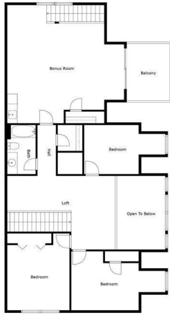
Size And Dimensions Are Approximate. Actual Measurements May Vary