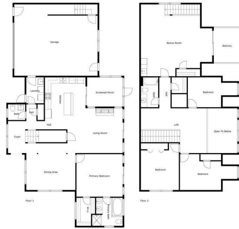
Size And Dimensions Are Approximate. Actual Measurements May Vary

website: www.AffinityRealEstate.com | email: info@affinityrealestate.com | office: 218-237-3333 | fax: 218-237-3377