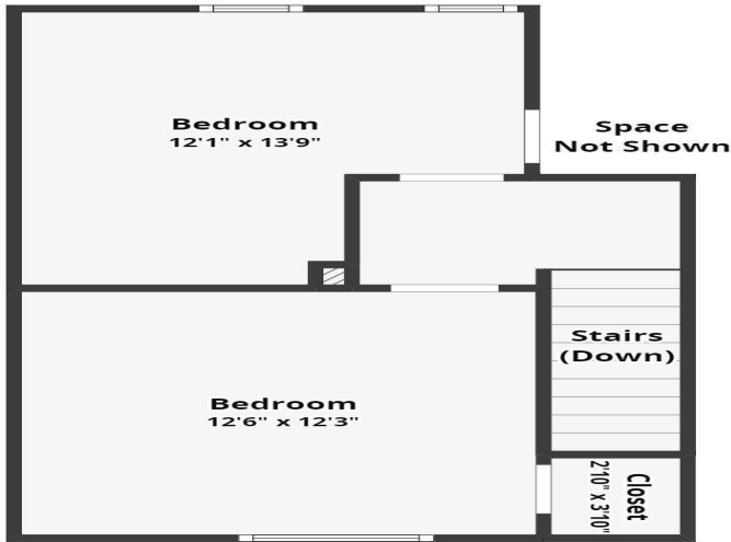
All dimensions are approximate and subject to independent verification