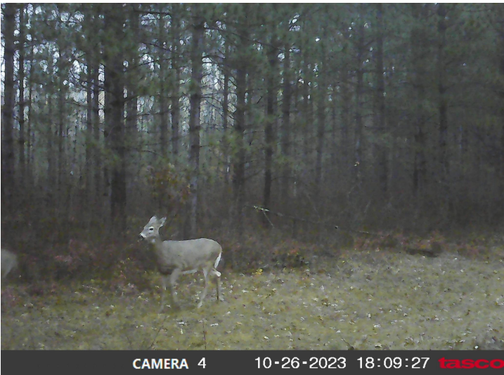
CAMERA 4 10-26-2023 18:09:27 tasco