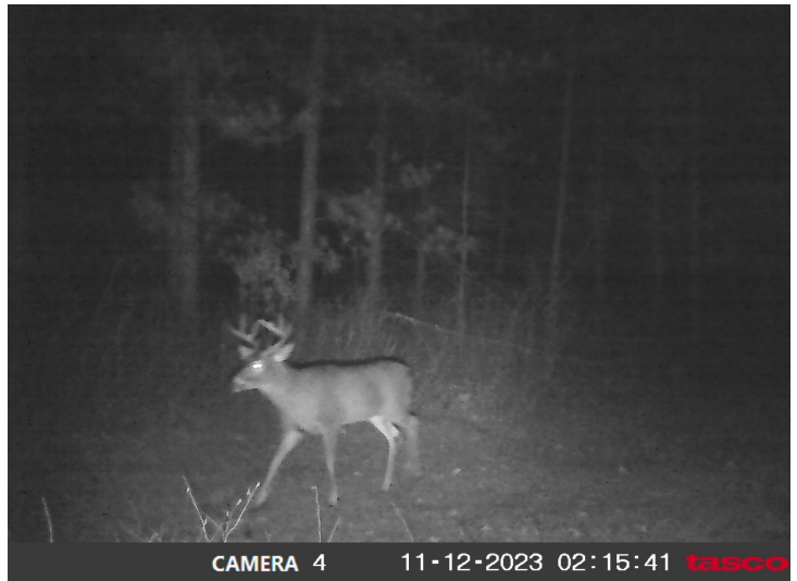
CAMERA 4 11-12-2023 02:15:41 tasco