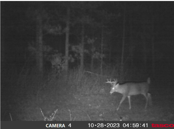
CAMERA 4 10-28-2023 04:59:41 tasco