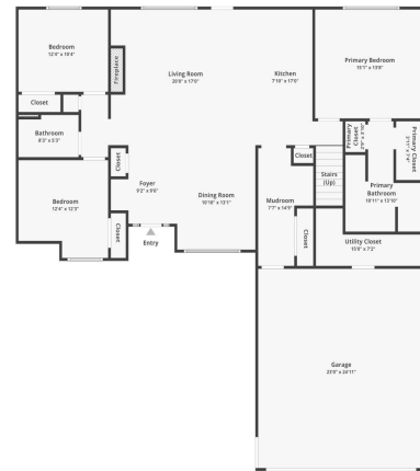
900 Lake Forest Cir, Detroit Lakes, MN 56501 Floor 1