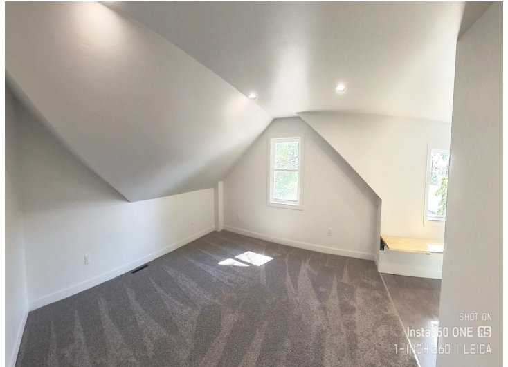
SHOT ON Insta360 ONE RS 1-INCH 360 | LEICA

website: www.AffinityRealEstate.com | email: info@affinityrealestate.com | office: 218-237-3333 | fax:218-237-3377