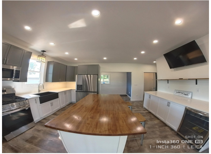
SHOT ON Insta360 ONE RS 1-INCH 360 | LEICA