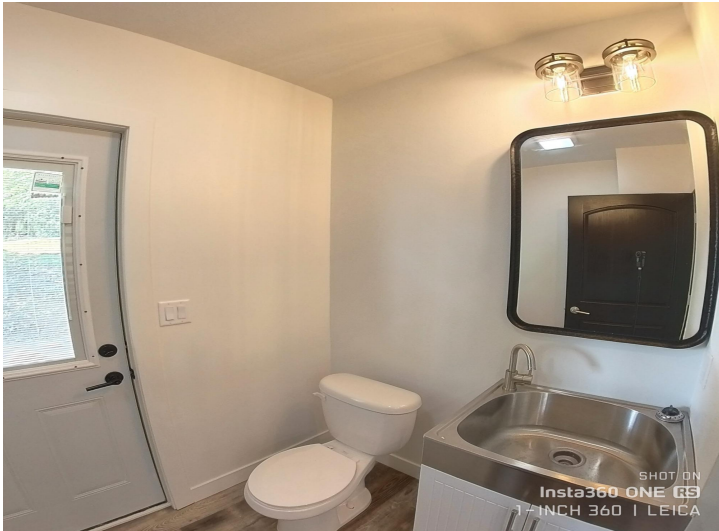
SHOT ON Insta360 ONE RS 1-INCH 360 | LEICA