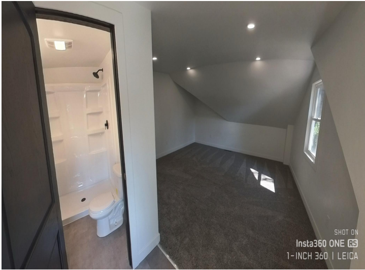
SHOT ON Insta360 ONE RS 1-INCH 360 | LEICA