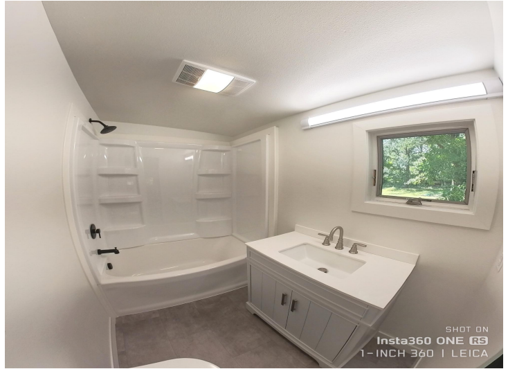
SHOT ON Insta360 ONE RS 1-INCH 360 | LEICA