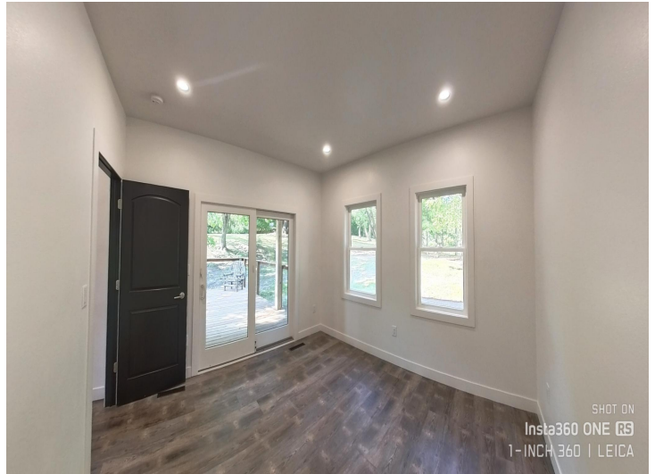
SHOT ON Insta360 ONE RS 1-INCH 360 | LEICA

website: www.AffinityRealEstate.com | email: info@affinityrealestate.com | office: 218-237-3333 | fax:218-237-3377