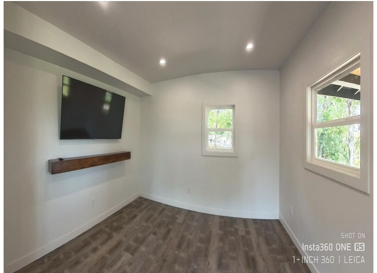
SHOT ON Insta360 ONE RS 1-INCH 360 | LEICA

website: www.AffinityRealEstate.com | email: info@affinityrealestate.com | office: 218-237-3333 | fax:218-237-3377