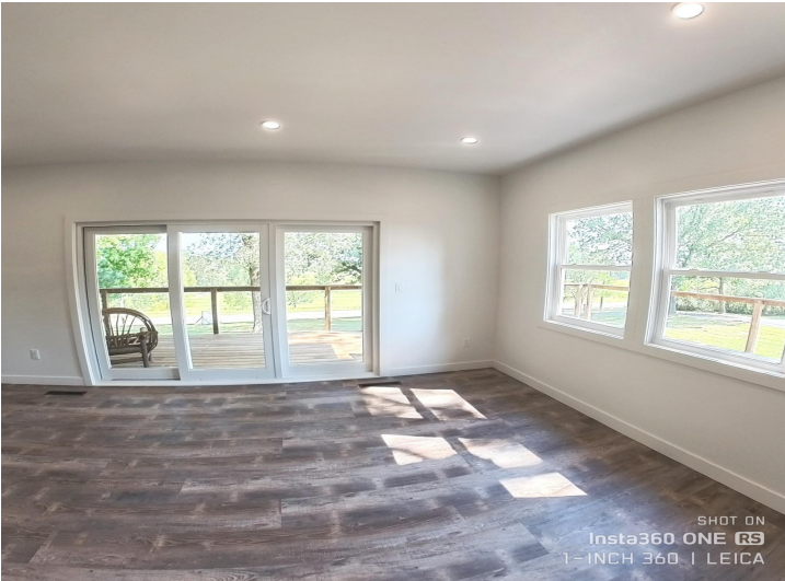
SHOT ON Insta360 ONE RS 1-INCH 360 | LEICA