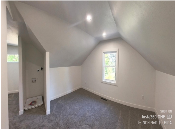
SHOT ON Insta360 ONE RS 1-INCH 360 | LEICA