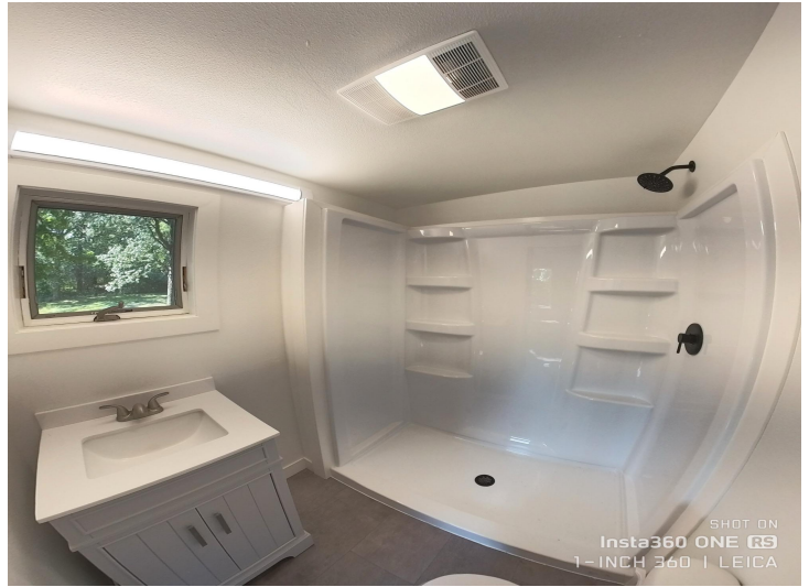
SHOT ON Insta360 ONE RS 1-INCH 360 | LEICA