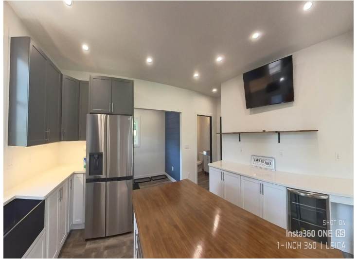
SHOT ON Insta360 ONE RS 1-INCH 360 | LEICA