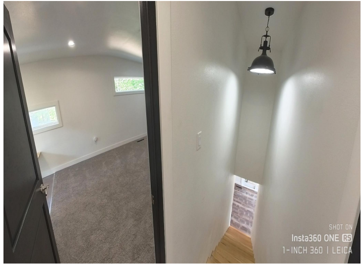
SHOT ON Insta360 ONE RS 1-INCH 360 | LEICA