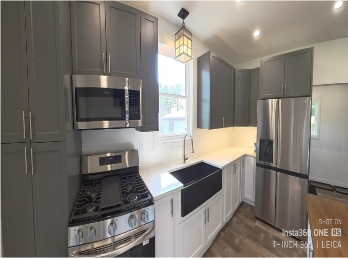
SHOT ON Insta360 ONE RS 1-INCH 360 | LEICA