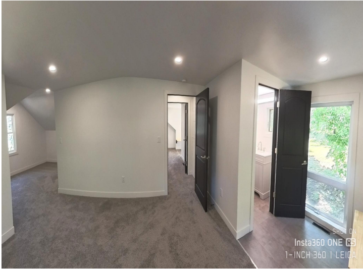
SHOT ON Insta360 ONE RS 1-INCH 360 | LEICA