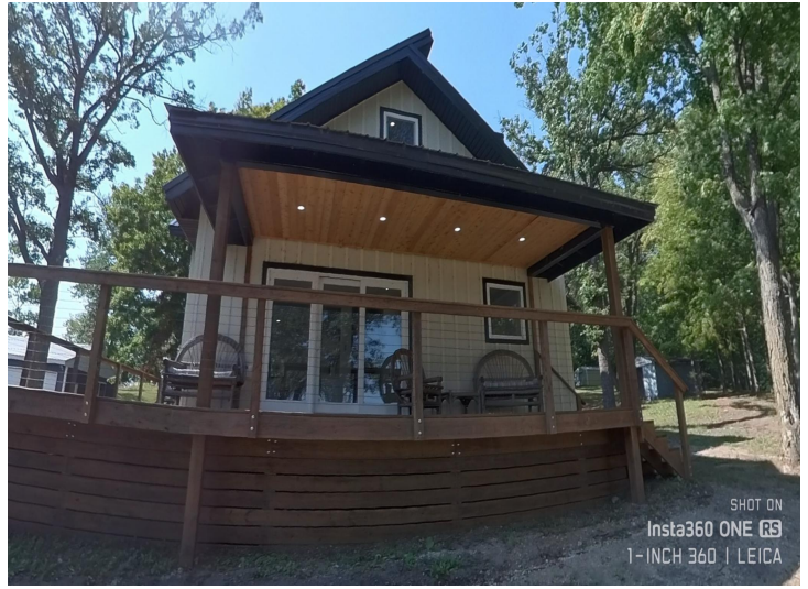
SHOT ON Insta360 ONE RS 1-INCH 360 | LEICA