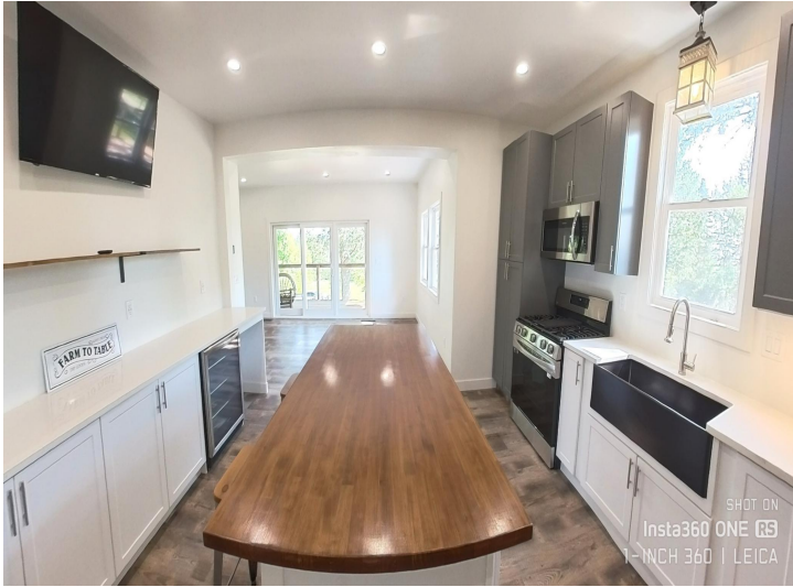
SHOT ON Insta360 ONE RS 1-INCH 360 | LEICA