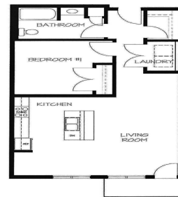
1 BEDROOM #104