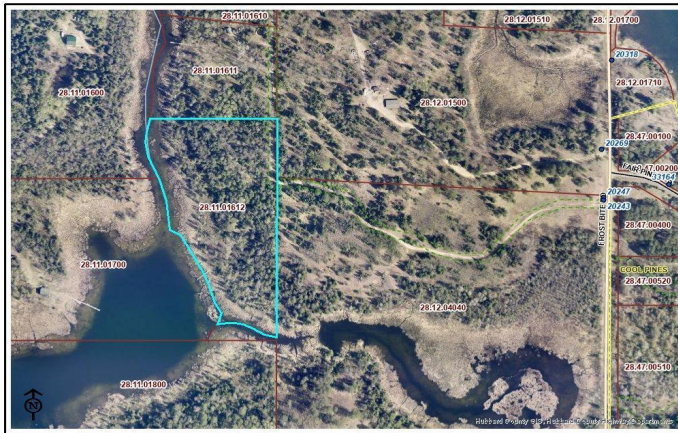
Parcel Viewer Hubbard County - 301 Court Ave., Park Rapids, MN 56470 Created 9/22/2024 at 08:24 AM