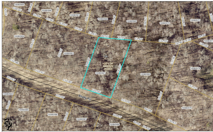
L23 B32 Shady Trail These data are provided on an "AS-IS" basis, without warranty of any type, expressed or implied, including but not limited to any warranty as to their performance, merchantability, or fitness for any particular purpose. Date: 9/19/2024 Time: 10:34 AM