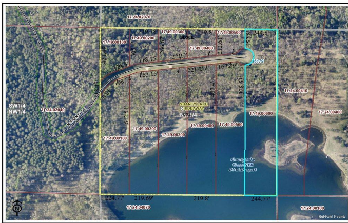
Parcel Viewer Hubbard County - 301 Court Ave., Park Rapids, MN 56470 Created 9/26/2024 at 10:25 AM