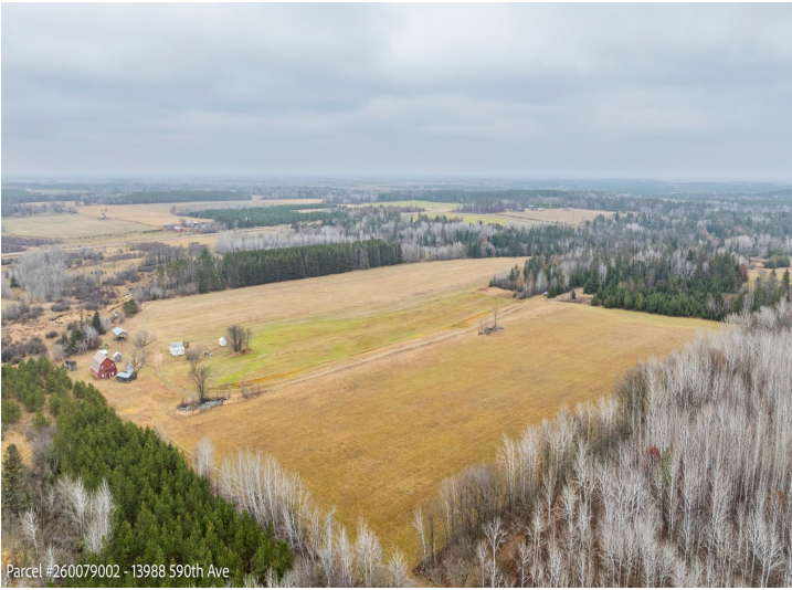
Parcel #260079002 - 13988 590th Ave