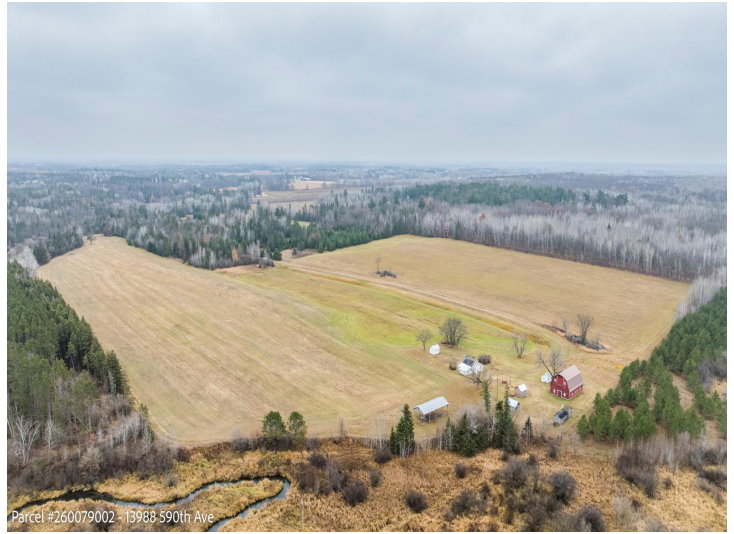
Parcel #260079002 - 13988 590th Ave

website: www.AffinityRealEstate.com | email: info@affinityrealestate.com | office: 218-237-3333 | fax:218-237-3377