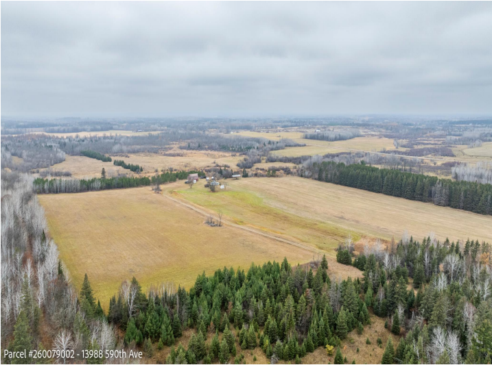
Parcel #260079002 - 13988 590th Ave