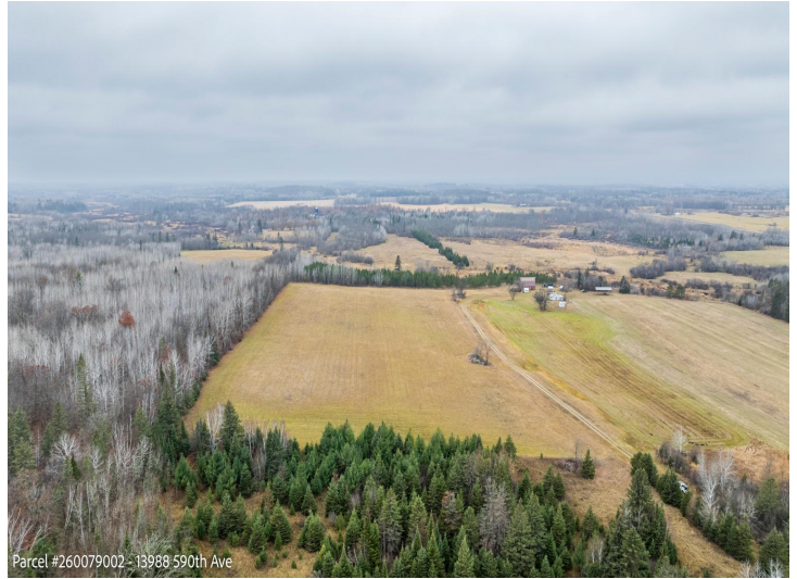
Parcel #260079002 - 13988 590th Ave