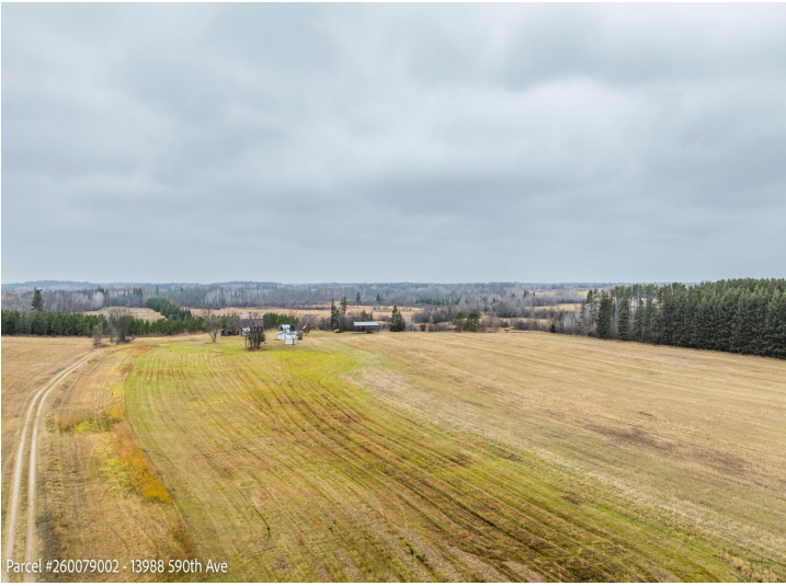
Parcel #260079002 - 13988 590th Ave