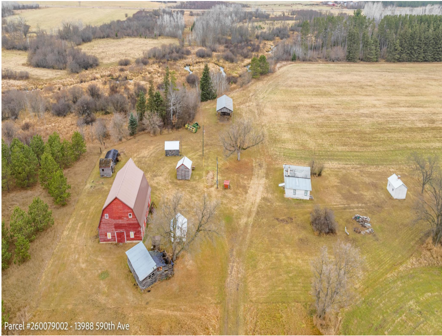
Parcel #260079002 - 13988 590th Ave