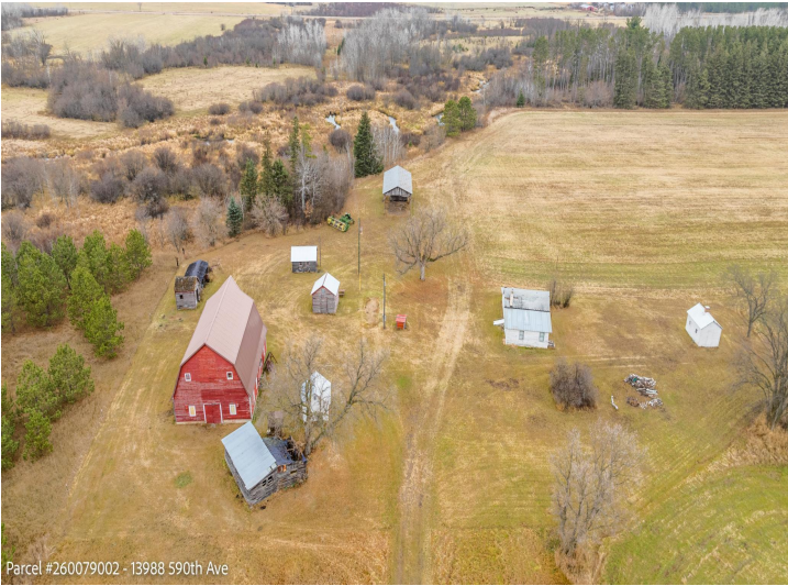
Parcel #260079002 - 13988 590th Ave