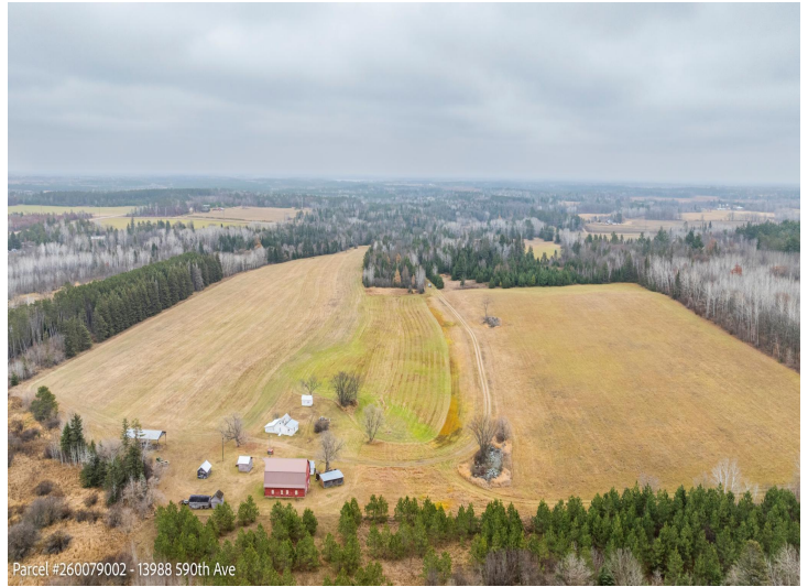
Parcel #260079002 - 13988 590th Ave