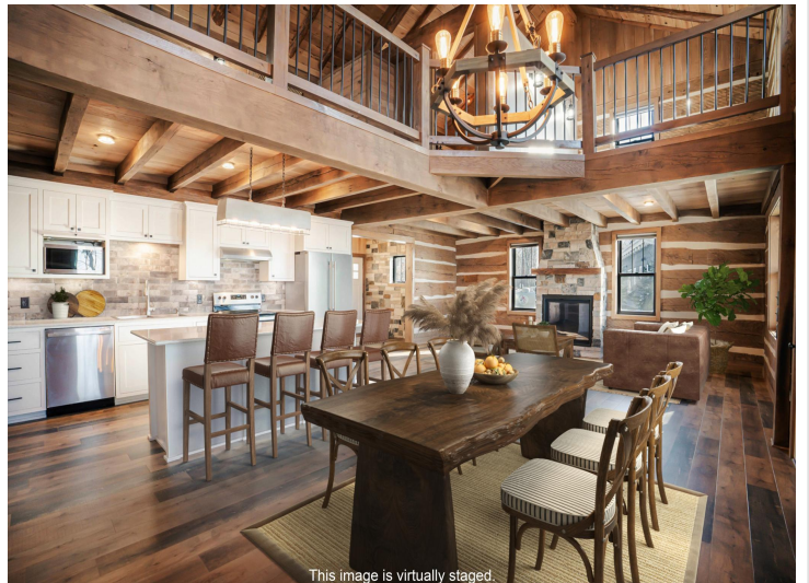
This image is virtually staged.

website: www.AffinityRealEstate.com | email: info@affinityrealestate.com | office: 218-237-3333 | fax:218-237-3377