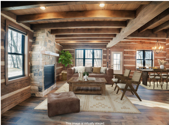
This image is virtually staged.