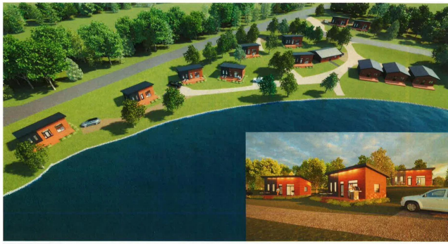
PELICAN LAKE RESORT