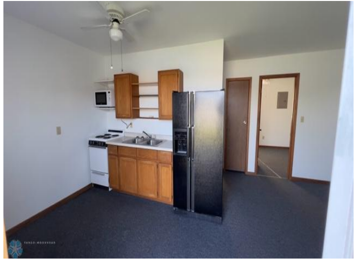
KOHLER-STROM'S RESORT COMMON INTEREST COMMUNITY NO. 109