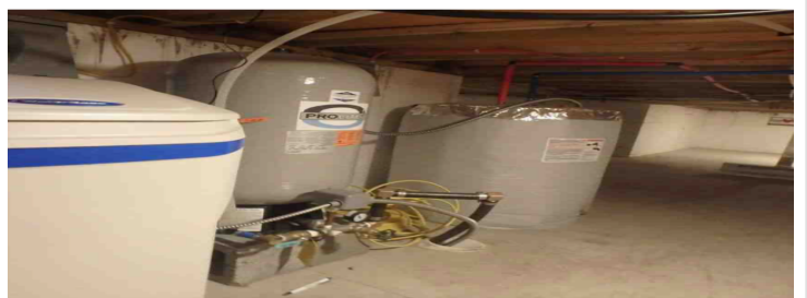
CRAWL SPACE AND WATER SYSTEMS