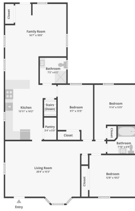
1807 Beltrami Ct NW, Bemidji, MN 56601 Floor 1

Floor plan/area cannot be used for building or design purposes. Sizes and dimensions are approximate.