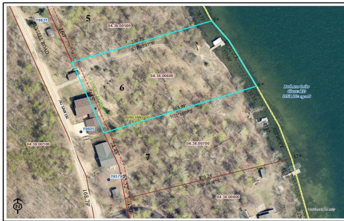
Jigsaw Drive Hubbard County - 301 Court Ave, Park Rapids, MN 56470 Created 9/12/2025 at 10:15 AM