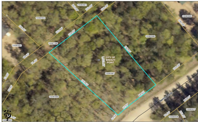
These data are provided on an "AS-IS" basis, without warranty of any type expressed or implied, including but not limited to any warranty as to their performance, merchantability, or fitness for any particular purpose. L10 B17 Spring Loop Dr Date: 3/8/2025 Time: 3:19 PM