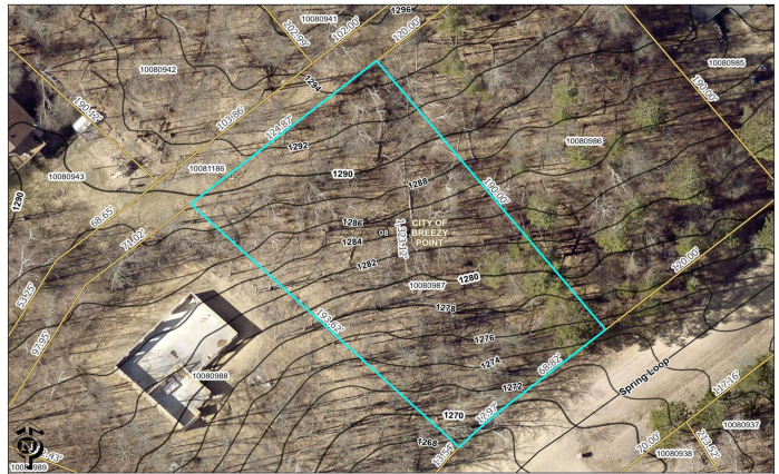
These data are provided on an "AS-IS" basis, without warranty of any type expressed or implied, including but not limited to any warranty as to their performance, merchantability, or fitness for any particular purpose. L10 B17 Spring Loop Dr Topography Date: 3/8/2025 Time: 3:21 PM