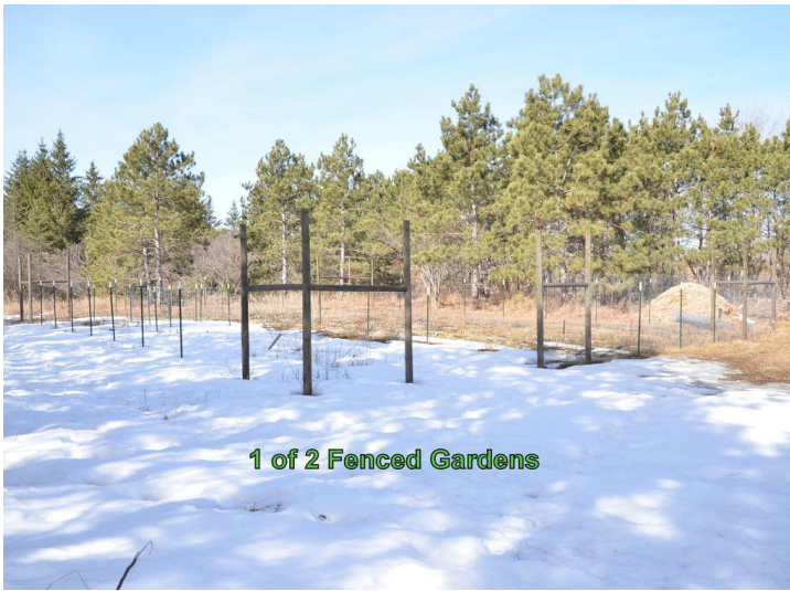
1 of 2 Fenced Gardens