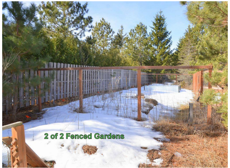
2 of 2 Fenced Gardens