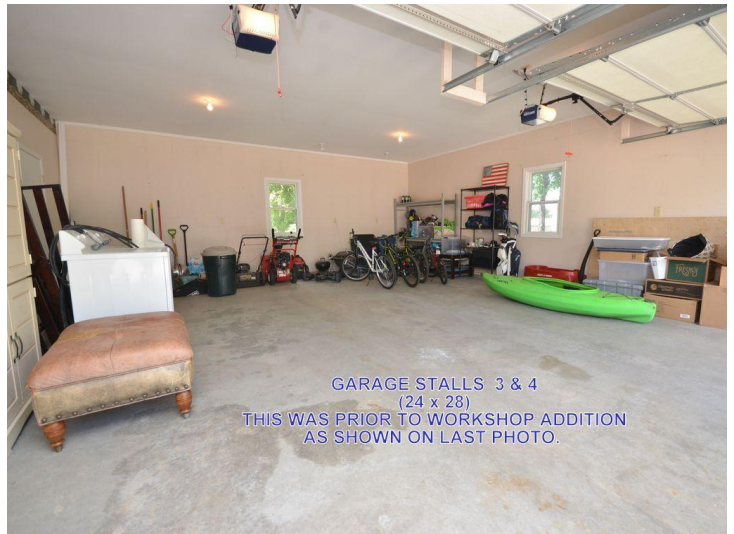
GARAGE STALLS 3 & 4 (24 x 28) THIS WAS PRIOR TO WORKSHOP ADDITION AS SHOWN ON LAST PHOTO.