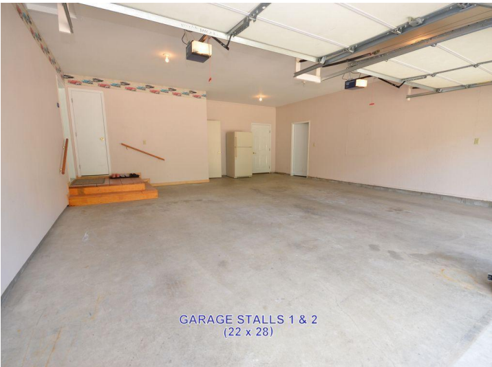
GARAGE STALLS 1 & 2 (22 x 28)