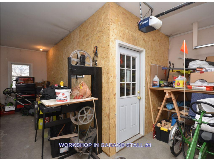
WORKSHOP IN GARAGE STALL #4

website: www.AffinityRealEstate.com | email: info@affinityrealestate.com | office: 218-237-3333 | fax: 218-237-3377