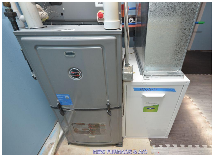
NEW FURNACE & A/C

website: www.AffinityRealEstate.com | email: info@affinityrealestate.com | office: 218-237-3333 | fax: 218-237-3377