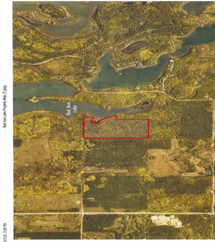
Bd. Ave. Log Property May 11/2024

Parcel Viewer Hubbard County - 3E Court Ave, Park Rapids, MN 56470 Created: 5/17/2024 at 12:55 PM