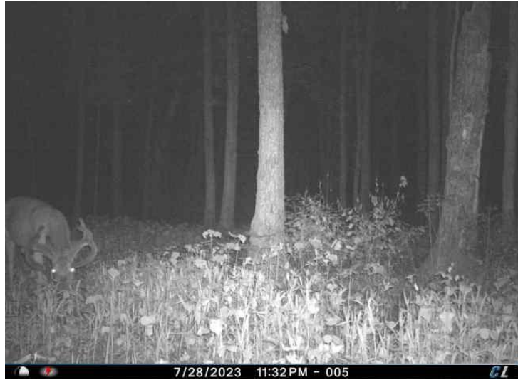
7/28/2023 11:32 PM - 005

website: www.AffinityRealEstate.com | email: info@affinityrealestate.com | office: 218-237-3333 | fax:218-237-3377