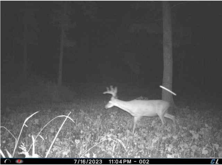
7/16/2023 11:04 PM - 002