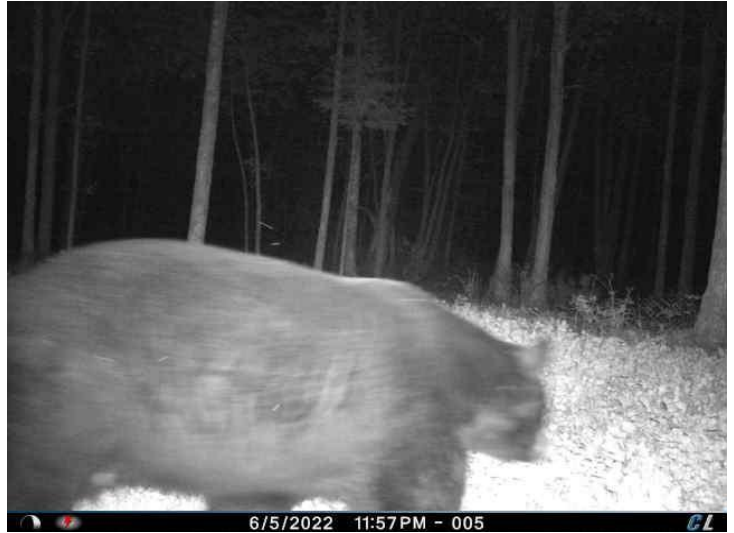
6/5/2022 11:57 PM - 005