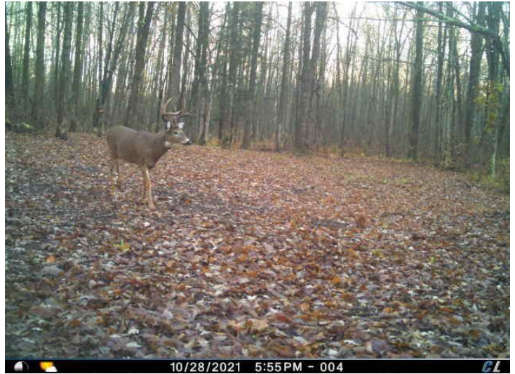
10/28/2021 5:55 PM - 004