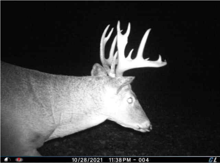
10/28/2021 11:38 PM - 004