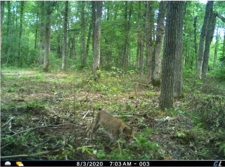
8/3/2020 7:03 AM - 003