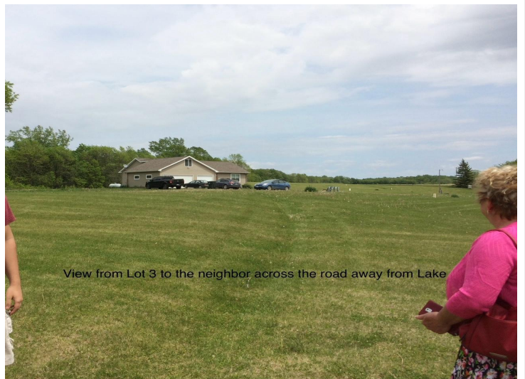
View from Lot 3 to the neighbor across the road away from Lake

website: www.AffinityRealEstate.com | email: info@affinityrealestate.com | office: 218-237-3333 | fax: 218-237-3377