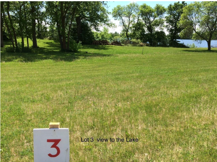
Lot 3 view to the Lake