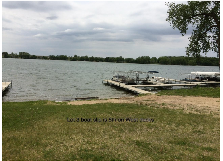
Lot 3 boat slip is 5th on West docks