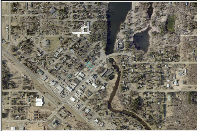
These data are provided on an "AS-IS" basis, without warranty of any type, expressed or implied, including but not limited to any warranty as to their performance, merchantability, or fitness for any particular purpose. 403 Barclay Ave Pine River PID 943371040 This map is not a substitute for accurate field surveys or for creating actual property lines and any adjacent features. Date: 4/26/2024