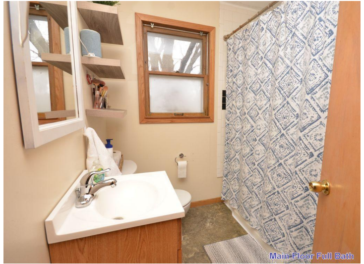
Main Floor Full Bath