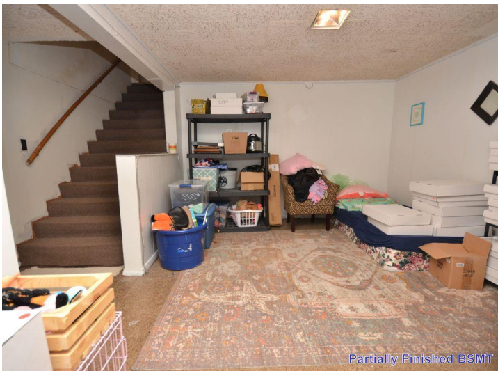
Partially Finished BSMT