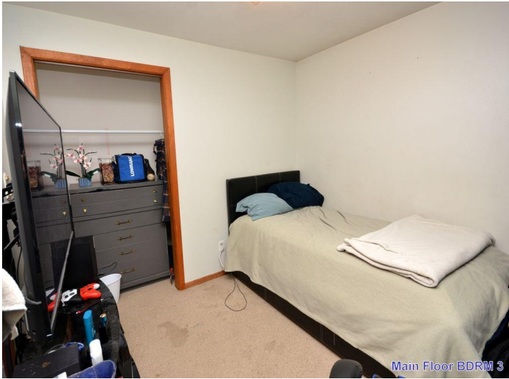
Main Floor BDRM 3