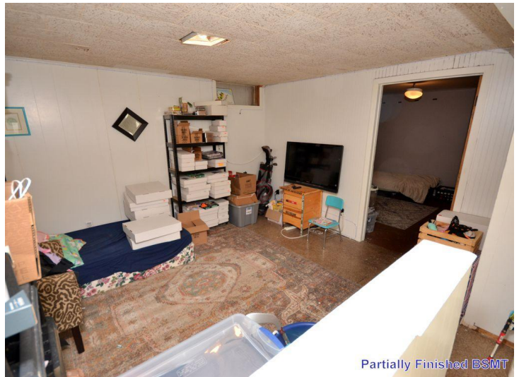
Partially Finished BSMT