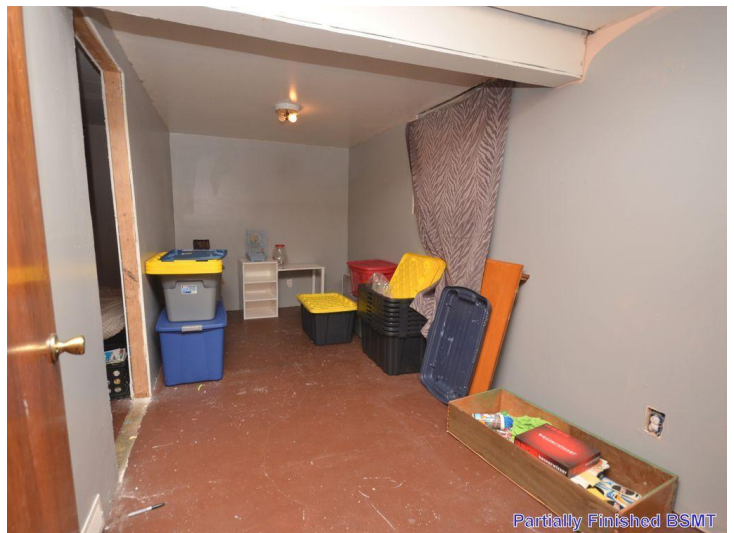
Partially Finished BSMT

website: www.AffinityRealEstate.com | email: info@affinityrealestate.com | office: 218-237-3333 | fax: 218-237-3377