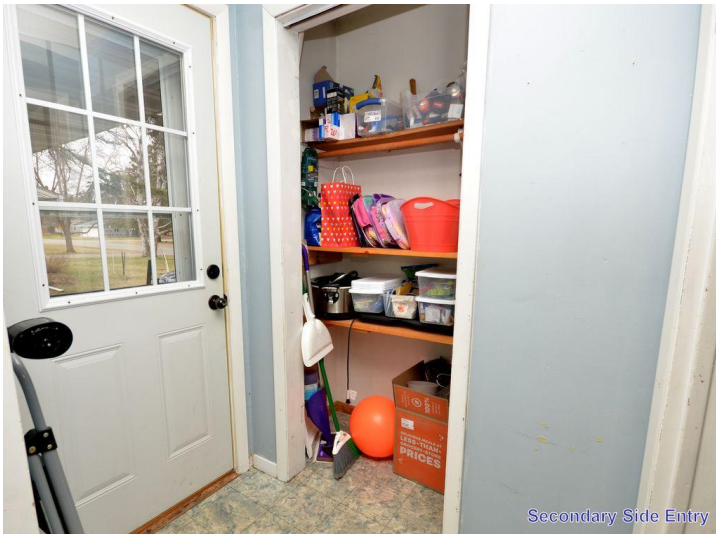
Secondary Side Entry