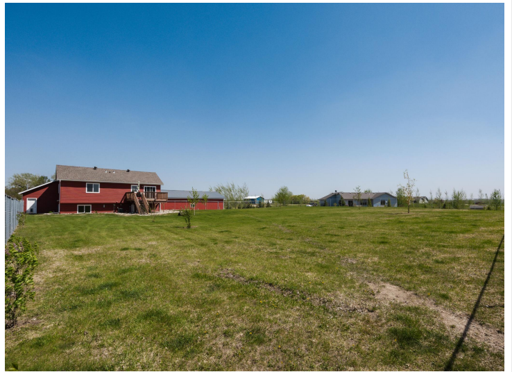
297 263rd St S, Hawley