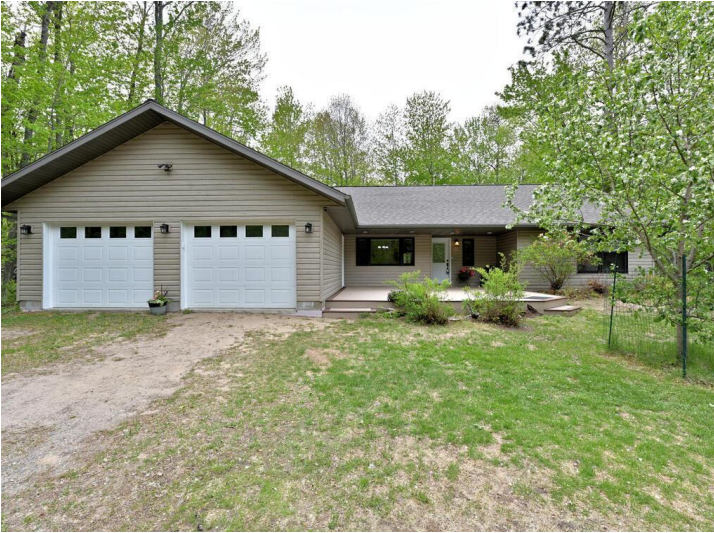
MAIN FLOOR Inside Area 2487 ft 2