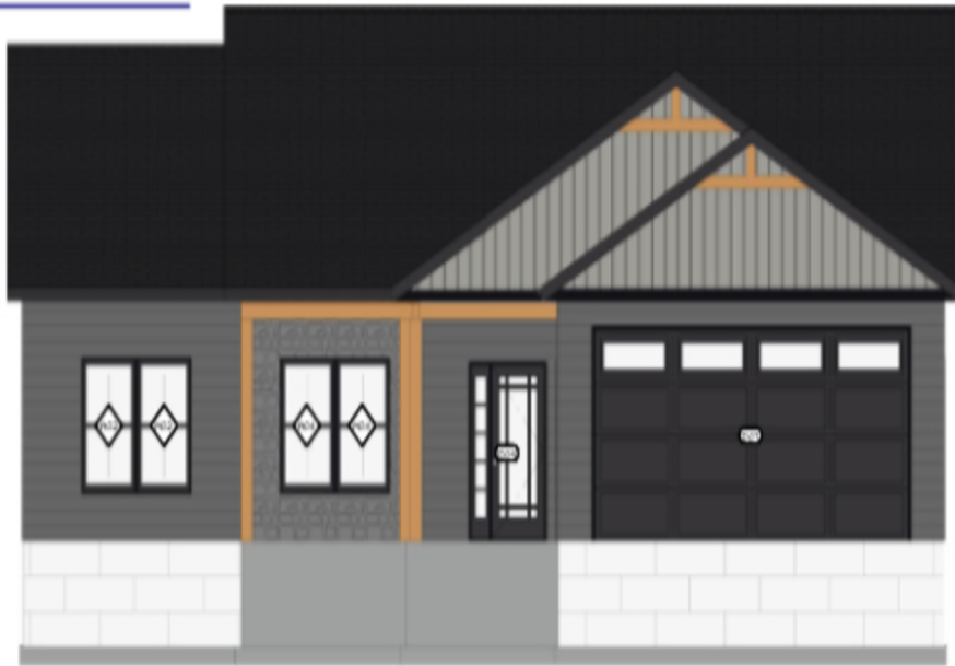
EXTERIOR ELEVATION FRONT