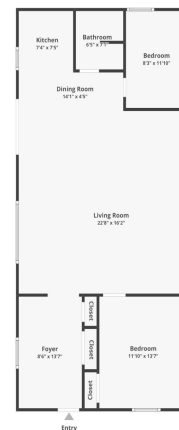
21998 Excelsior Dr., Nevis, MN 56467 Floor 1

Floor plan/chart cannot be used for building or design purposes. Sizes and dimensions are approximate.