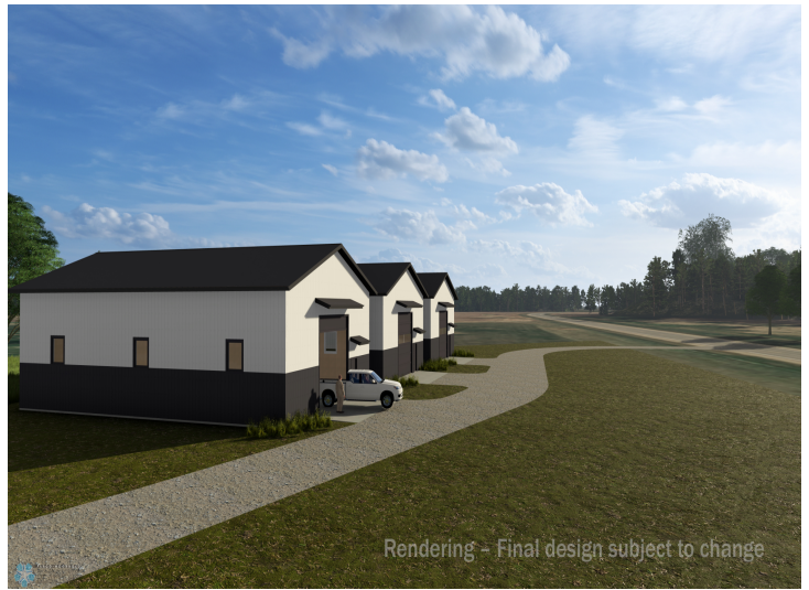
Rendering - Final design subject to change