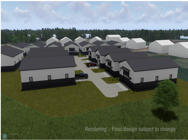
Rendering - Final design subject to change