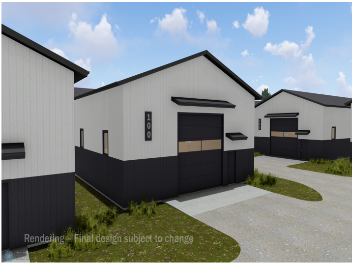
Rendering - Final design subject to change