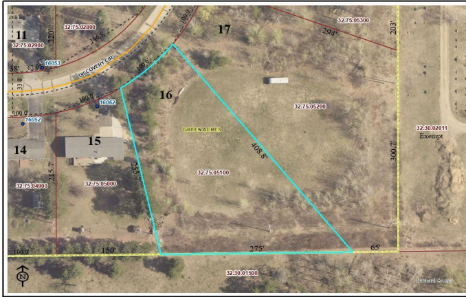
Lot 16 Discovery Circle Hubbard County - 301 Court Ave, Park Rapids, MN 56470 Created 7/30/2025 at 10:56 AM