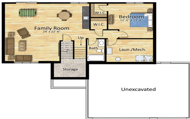
Lower Floor Plan