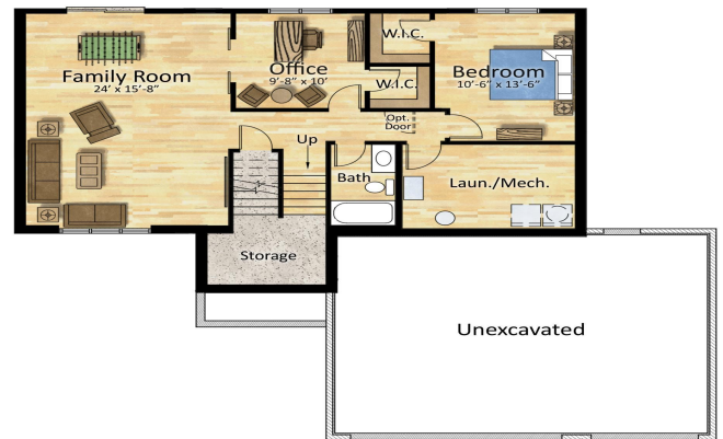
Lower Floor Plan