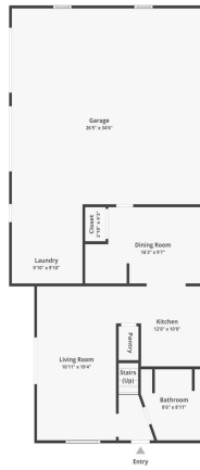
18346 Ithaca Dr, Park Rapids, MN 56470 Floor 1

Floor plan/area cannot be used for building or design purposes. Sizes and dimensions are approximate.