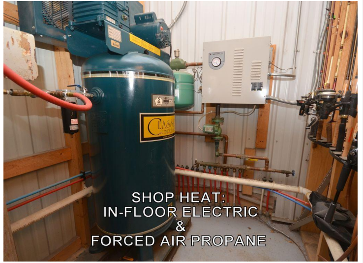
SHOP HEAT: IN-FLOOR ELECTRIC & FORCED AIR PROPANE