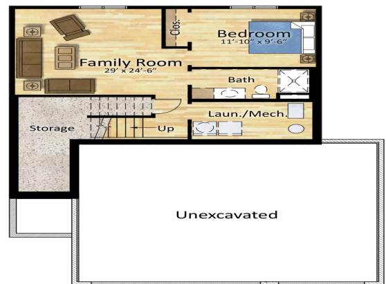
Lower Floor Plan