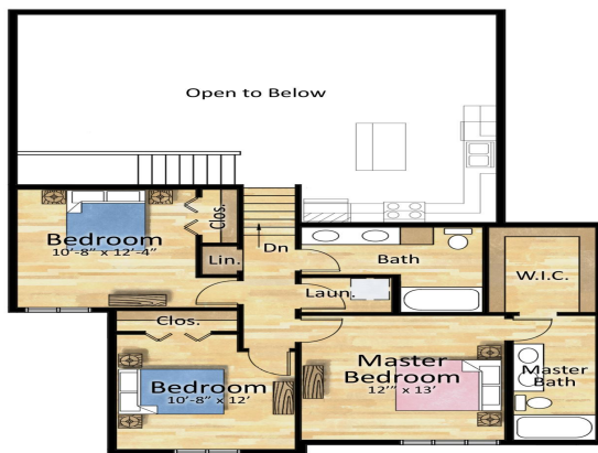
Upper Floor Plan